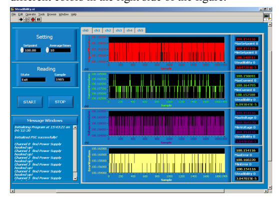
Figure 5 Analog channel test

The connection between the setpoint output channel and the readback input channel is via a 9pin "D" type connector with pin jumpers. The figure 5 shows Setpoint and Readback. Setpoint and AverageTimes can be configured. There are four curves and data for setpoint Readbacks displayed with different colors in the right side of the figure.