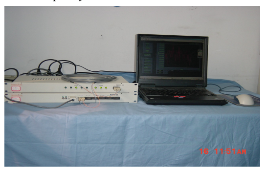
Figure 1 Standalone PSC Configuration.

The test system as shown in the figure 1, consist of a laptop and a chassis PSC and a chassis PSI. The laptop running LabVIEW is connected to the PSC via a serial port. The serial port driver and its application are developed by ourselves.