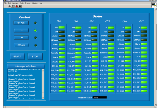
Figure 4 Six PSIs Digital channel test

The connection between the command output channel and the status input channel is via a 37pin "D" type connector with pin jumpers. There are four commands button in the top left corner and status monitors in the right side as shown in the figure 4.