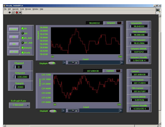
Figure 6. On-line test with a prototype power supply

During on-line testing, we found the LabVIEW program can be only running in a lower rate because of the serial limited communication rate.