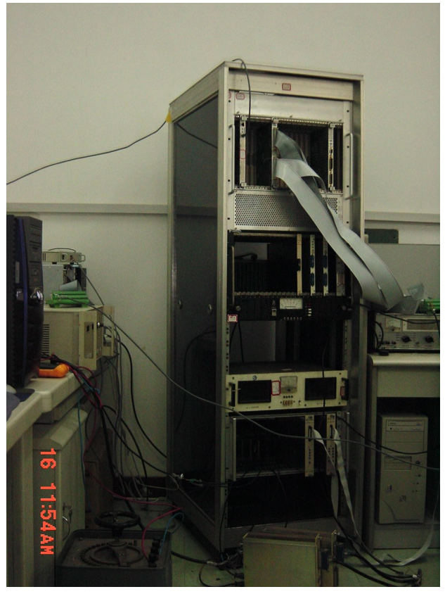
Figure 4 IP I/O System

is in process. It consists of a VME-64x crate with a CPU board(MVME2431) and a VME-CAMAC interface board and two CAMAC crates with a serial crate controller(SCC) and CAMAC I/O modules. The VME-CAMAC interface board is connected to the SCC. The SUN workstation will load the CPU board with VxWorks kernel and an EPICS application and runs MEDM display software.