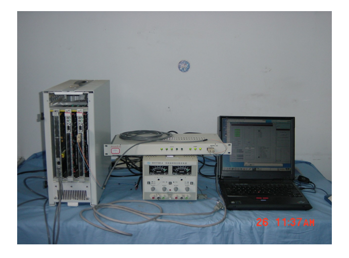
Figure 2 Portable PSC/PSI Configuration

The VME based PSC/PSI system has been built up. Figure 2 is portable configuration for VME based test. It is comprised of a small VME crate with a CPU board and PSC connected to a remote PSI.