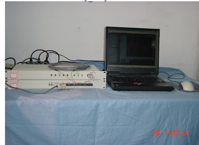
Figure 3. Standalone PSC Configuration.

This system has also been tested with the prototype power supply including current setting and readback in normal mode. For fast reads, burst mode is used and data is stored in memory. Data in memory can be read out and created a curve for stability analysis.